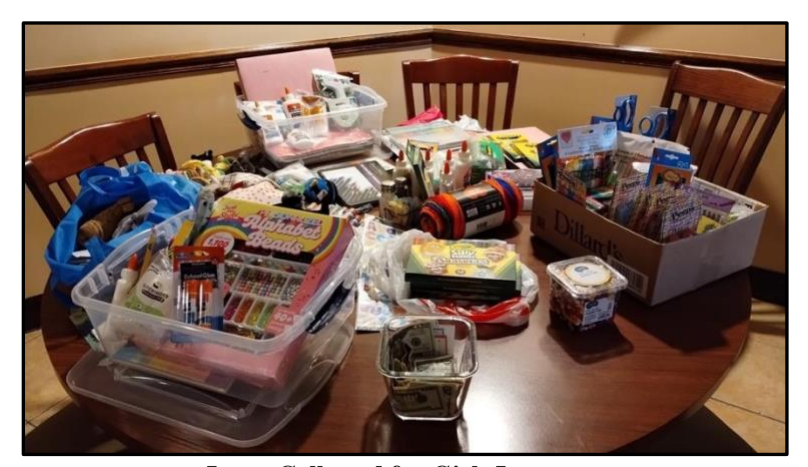
Items Collected for Girls Inc